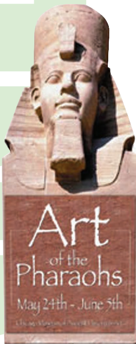
Summit with Rigid Substrate & Profiled Graphic

The Summit is a portable banner stand with a three-piece telescoping pole and spin-lock mechanism which allows for an adjustable mast and panel height up to 96". Just open the carrying case, put the unit on the floor, attach the graphic and adjust the height. Simply twist the spin-lock mechanism and slide the base collar up and down. No tools needed. 50w halogen spotlight and literature holders are available. All units are available in silver and black. The Summit can be a single or double-sided unit. Rigid Substrates with profiled graphics can be used on the Summit.