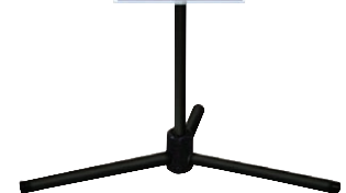
Summit with Combination Graphic and Literature Holder