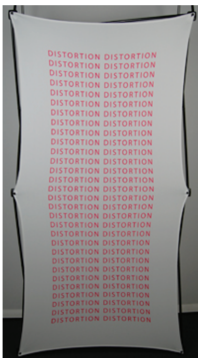
5" in - least amount of distortion