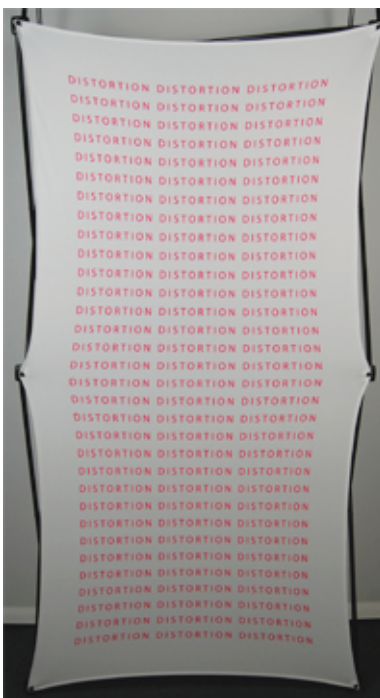
3" in - distortion becomes more apparent