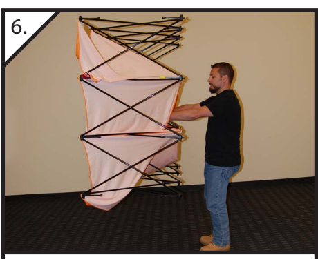
6. With an even and controlled motion, extend your arms up and out until you hear the snap!