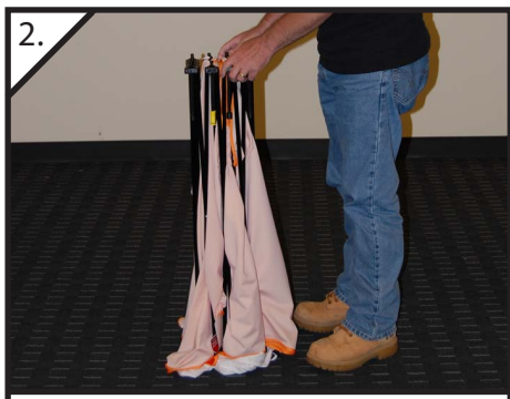
2. Place the frame on the floor graphic side down - feet facing you.