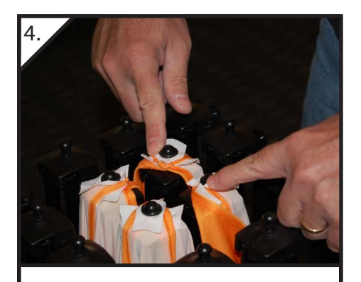
4. Locate center hubs.