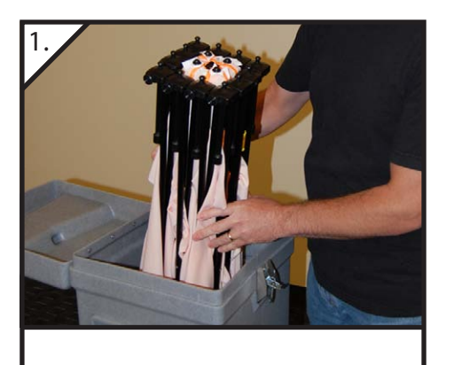
1. Unpack the display.