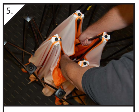
5. Reach in midway to grab the frame poles.