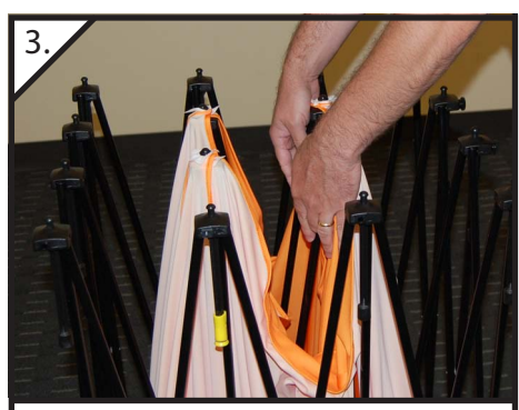
3. Separate the frame slightly. Make sure graphics are not caught on the frame or connectors.