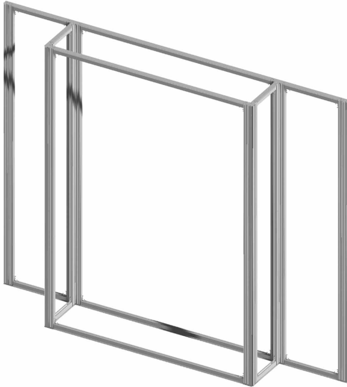
Exhibit Component - Wall 10B