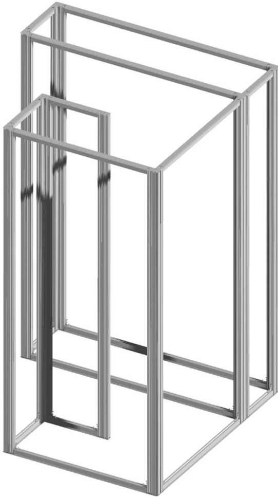
Exhibit Component - Tower D